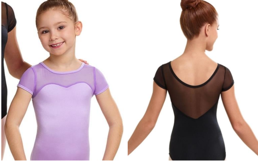
Foundations Leotard option one (lavender) with Pink tights - $45.00