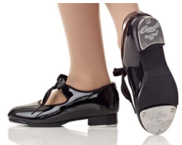
Building Blocks Tap $ 35.00