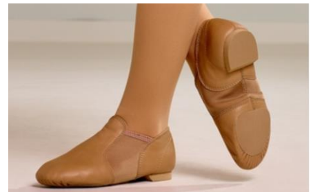
Building blocks Jazz Shoes $32.00