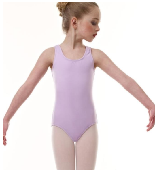
Foundations Leotard option two with Pink tights - $38.00