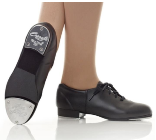
Foundations and up Tap $ 75.00