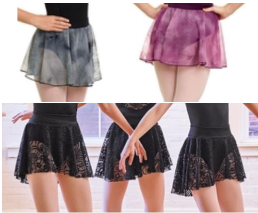
Skirt Options - $25.00