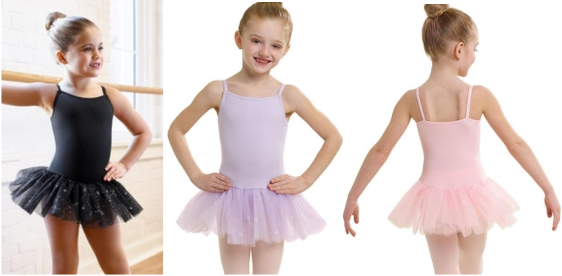
Building Blocks option one with Pink tights - $45.00