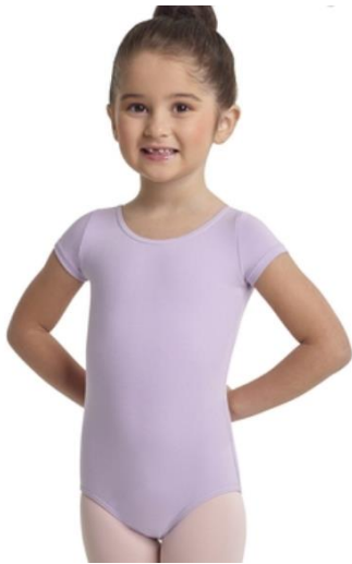
Building Blocks option two with Pink tights - $38.00