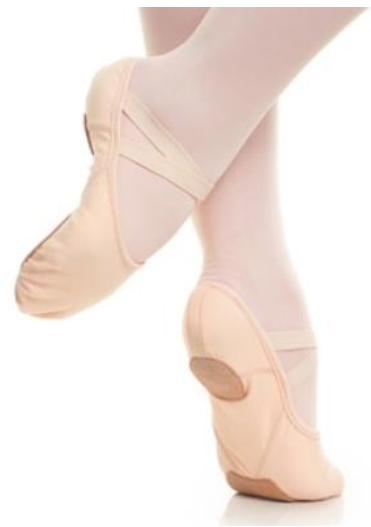
Foundations and up Ballet Shoes $38.00

Special Price on tights when added on to a bundle $12.00