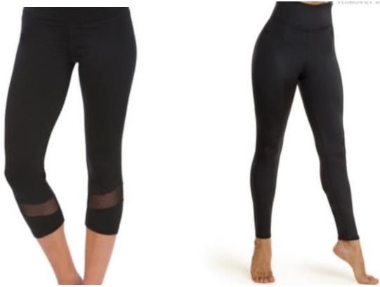
Black Capris $25.00 - Black High waisted leggings $28.00

Special Price on tights when added on to a bundle $12.00