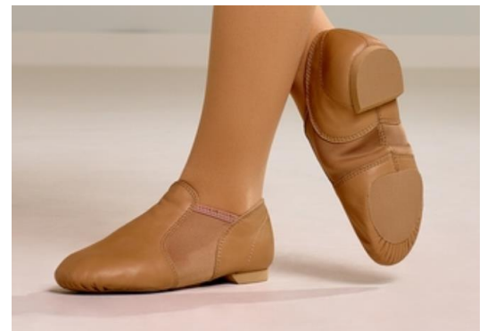
Foundations and up Jazz Shoes $38.00